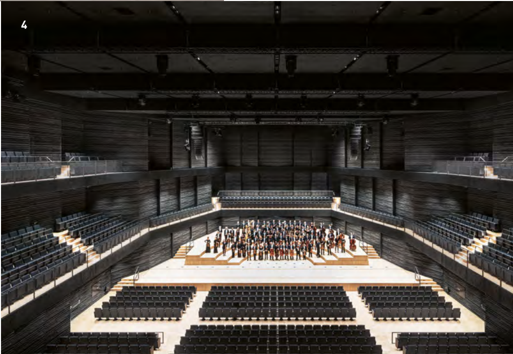
2 Retirement home, Tuttlingen (DE); © Elias-Schrenk-Haus, Tuttlingen/ 3 Müggelstraße residential building, Berlin (DE); © Sebastian Johnke/ 4 Gasteig cultural centre interim venue, Munich (DE); © HGESch

From in-depth design and consulting services to the realisation of complex building projects or the production of highly functional timber component systems, we deliver and assemble custom solutions tailored to address your challenges