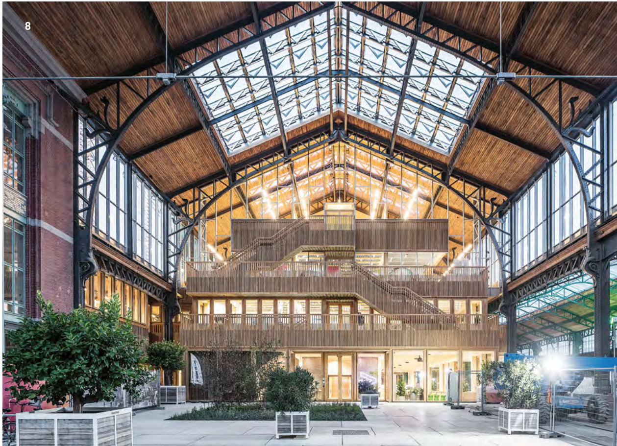
5 Canteen/Restaurant, Allendorf (DE); © Joachim Grothus / 6 Secondary School, Munich (DE); © Zooey Braun+ H4a Gessert + Randecker Architekten BDA / 7 Oberhof luge and bobsleigh track (DE); © Thüringer Wintersportzentrum Oberhof / 8 Gare Maritime; Brussels (BE), © Maxime Vermeulen