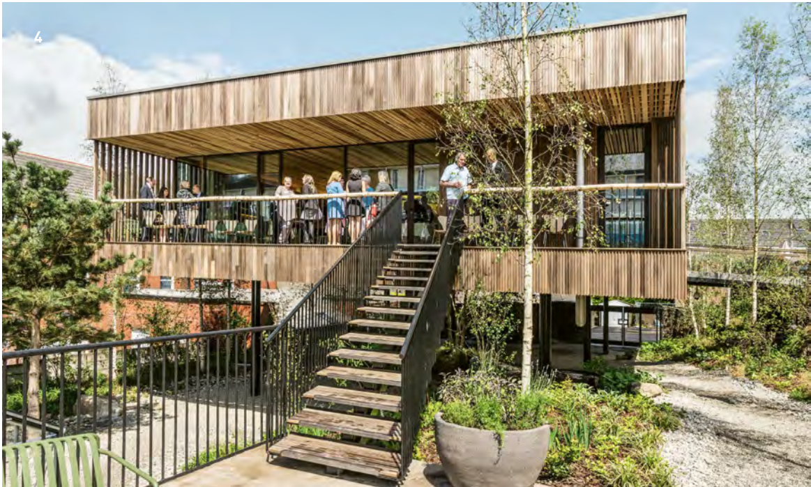
1 Metropolitan School, Berlin (DE); / 2 University Witten/Herdecke (DE); / 3 Highrise CARL, Pforzheim (DE); / 4 Maggie's Centre, Oldham (UK)