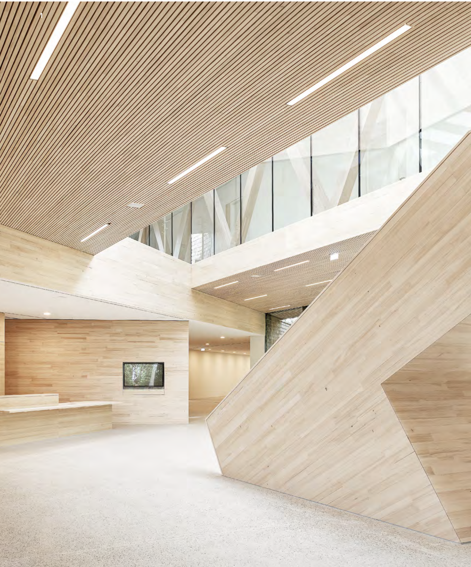
1 Ruhestein visitor information centre (DE); © Achim Birnbaum