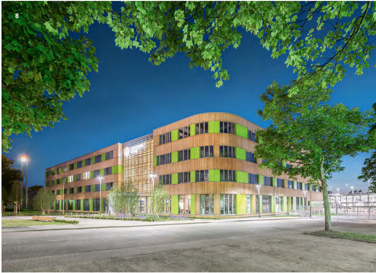
1-3 SKAIO highrise, Heilbronn (DE); © Bernd Borchardt / 4 Primary school, Munich (DE); © Tom Philippi 5+6 Office extension, Ulm (DE); © photodesign Armin Buhl / 7+8 Office building, Lübeck (DE); © Steffen Spitzner