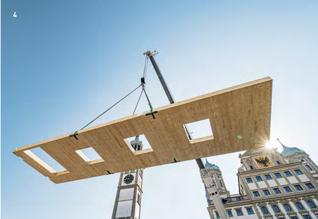
2 KUKA CNC robot/ 3 LENO® cross-laminated timber/ 4 Fuggerei NEXT500 pavilion, Augsburg (DE); © Eckhart Matthäus

We produce according to your specifications. You determine the degree of prefabrication yourself. No matter where, we are your go-to system supplier at your side.