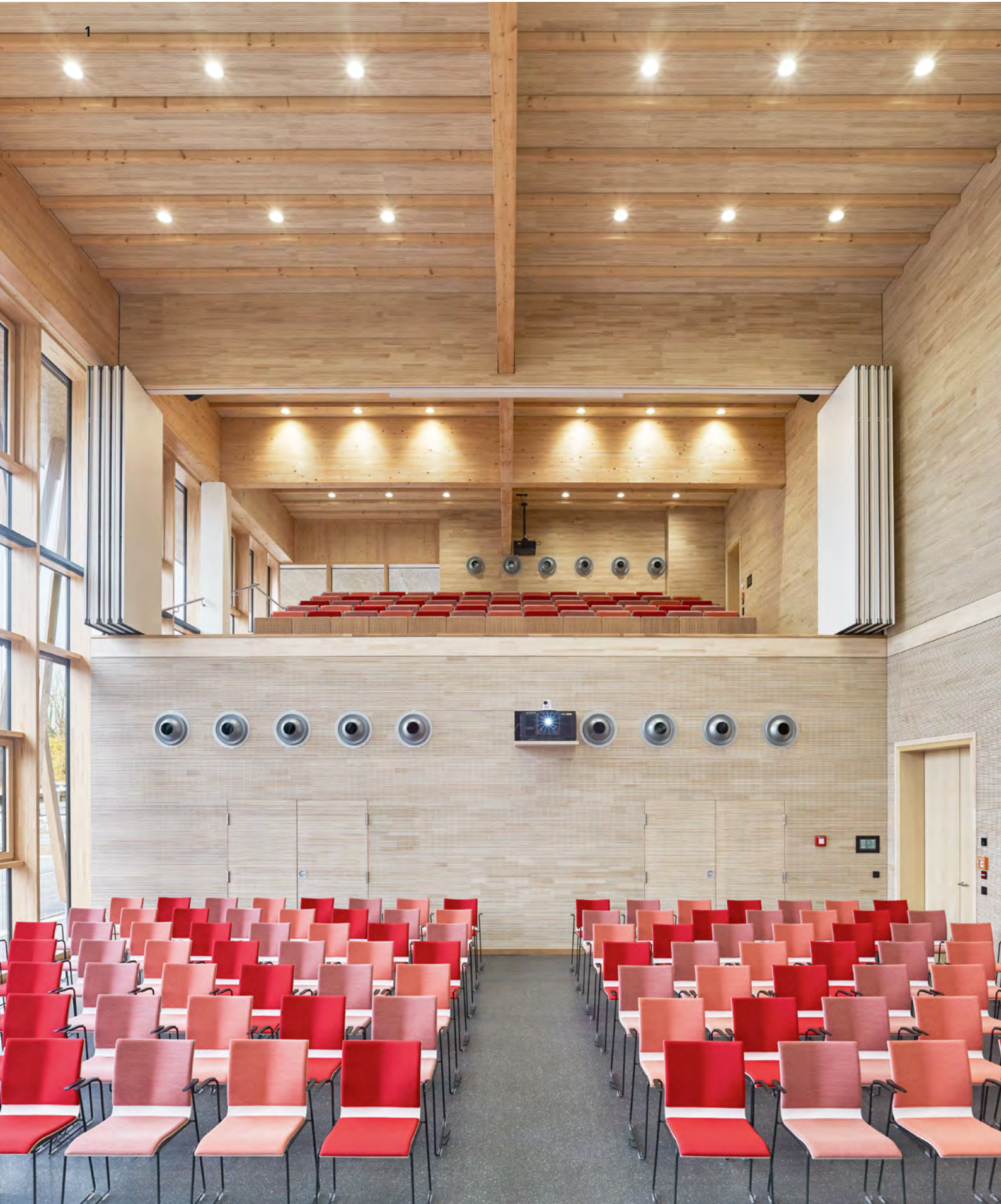
1 „Jowat“ house of technology, Detmold (DE)