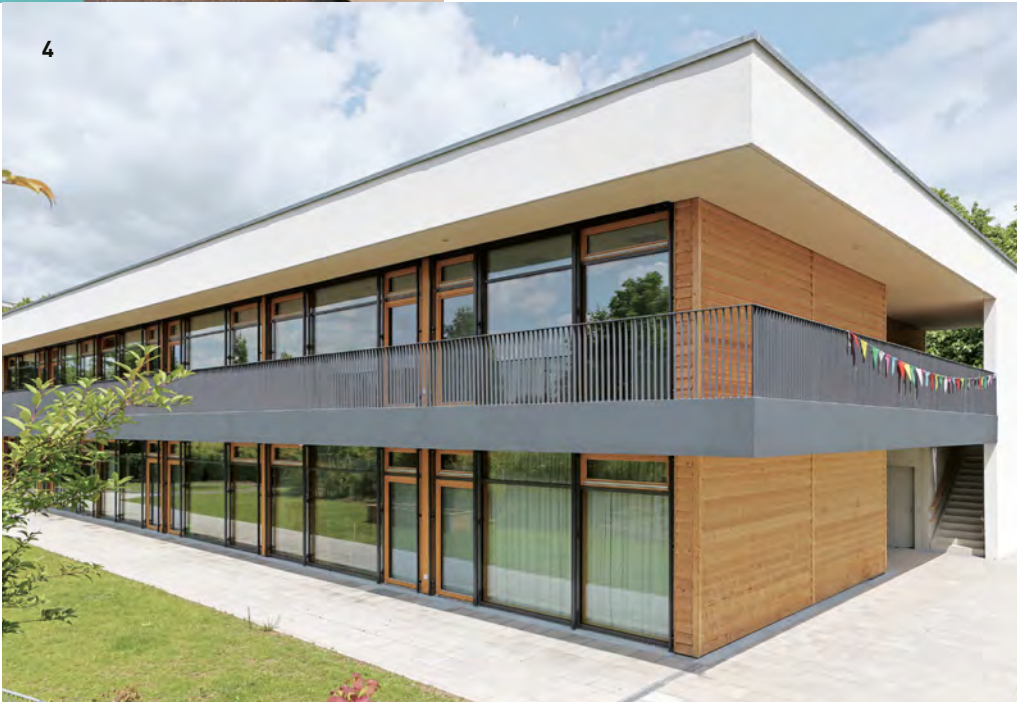
2+3 University Witten/Herdecke (DE); / 4 Nursery, Frankfurt am Main (DE)

With innovative solutions, we open up new possibilities and markets for structural timber engineering. Our expertise as a general contractor offers you total security – both in terms of cost control as well as schedule certainty.