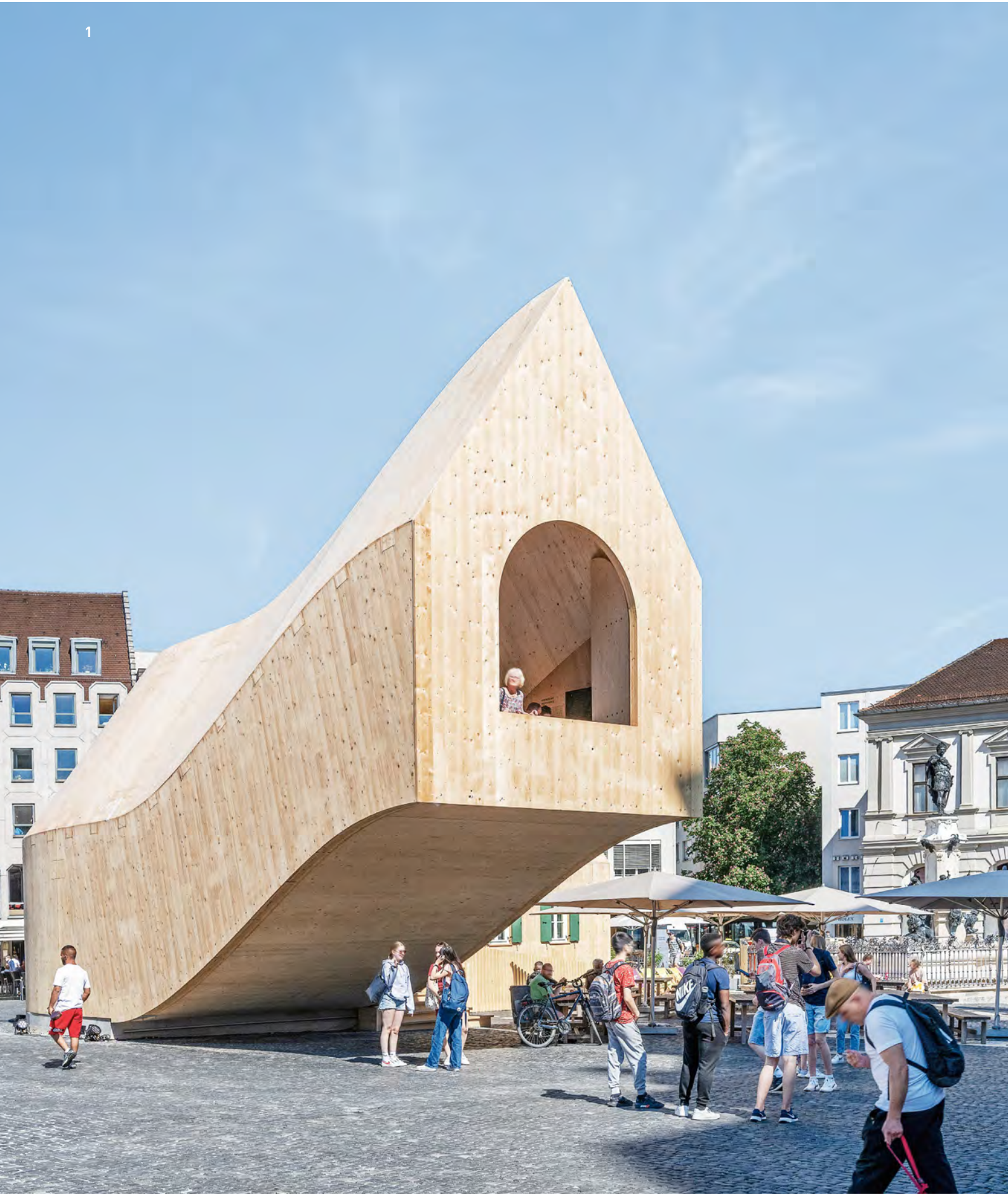
1 Fuggerei NEXT500 pavilion, Augsburg (DE)